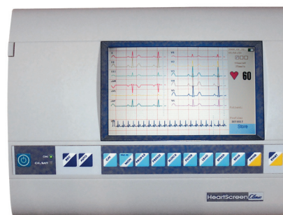
HeartScreen 112 Clinic